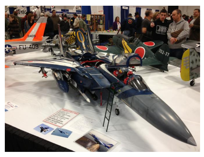
An awsome F-15 (above) two great plane below!

I took some photographs for all of you to enjoy.